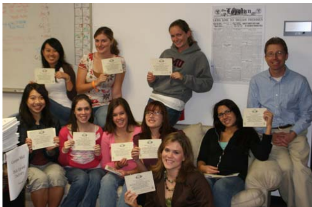
Congratulations, Loyola Marymount University Chapter!

Just like Virginia Beach in 2004, Valdosta was beautiful in 2006. These conventions were unlike the big-city, over-priced, over-booked professional conventions I had been to as part of major academic outings. Instead of paying an arm and a leg for lunch and visiting an over-hyped tourist attraction, the campus cons allowed opportunities for real networking and fellowship. The sessions were programmed with industry pros who were delighted to