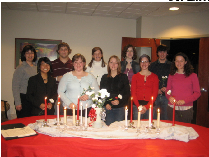
Congratulations, Evangel University Chapter!