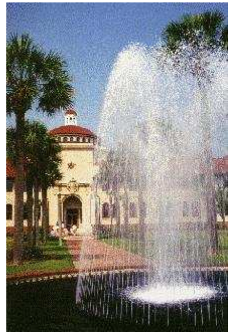
Valdosta State University.

If you only take one trip this year to hone your craft, this is the convention to attend! Please take a moment to review the materials mailed with this edition of The Reporter . You'll find the registration form, logistical data, and an agenda that